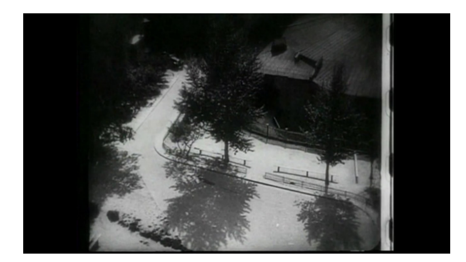
FIGURE N^0 9

Still from Man with a movie camera (Dziga Vertov 1929).