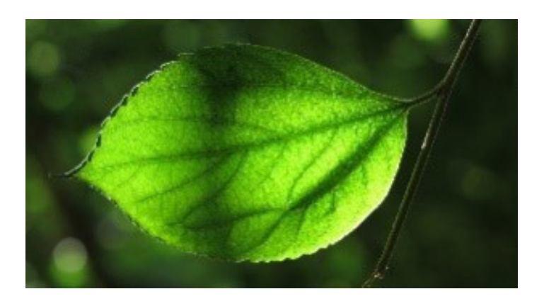
FIGURE N^0 3