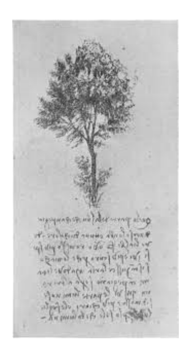
FIGURE Nº 11

Leonardo Da Vinci. Study of an Italian poplar. Red chalk. 1508.