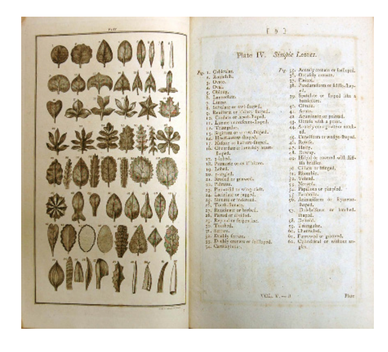
FIGURE Nº 4

Celtis Africana 768.