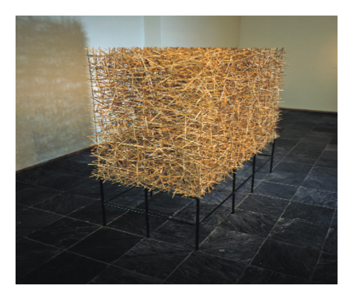
FIGURE Nº 7

Willem Boshoff (1951). Letters to God . From: Tree of Knowledge series. (1997). Splintered wood, carved wooden letters and steel frame. 195 x 150 x 90cm. Private collection.