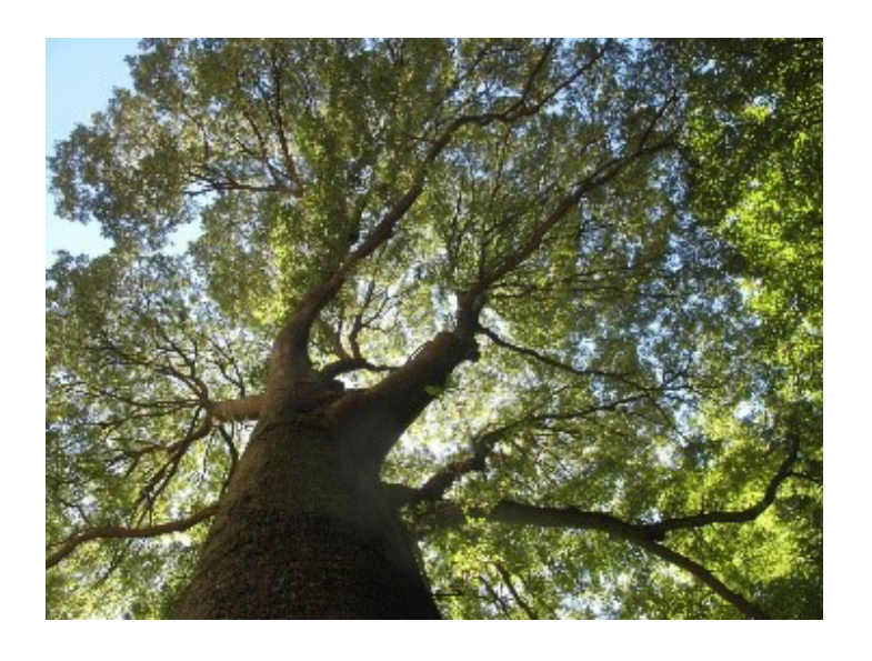
FIGURE Nº 1