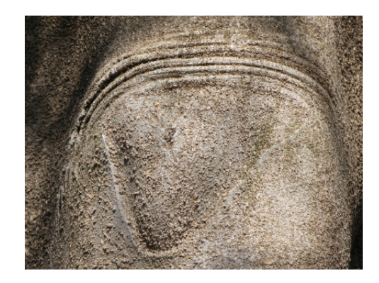
FIGURE N^0 14

Willem Boshoff. ACHEIROPOIETOS 4 and 9 from the series ACHEIROPOIETOI . 2007. Archival Lamda prints. 75 x 56,2cm.